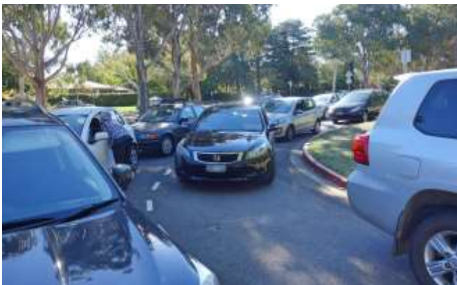
Two orderly queues form out of the school entry loop and down the main road.

Editor’s note: Following pressure from Council the ACT Government has promised to create traffic management plans for each ACT school. We are hopeful that this process, involving relevant roads and policing authorities, will be a chance for schools to create systems as effective as Forrest’s.