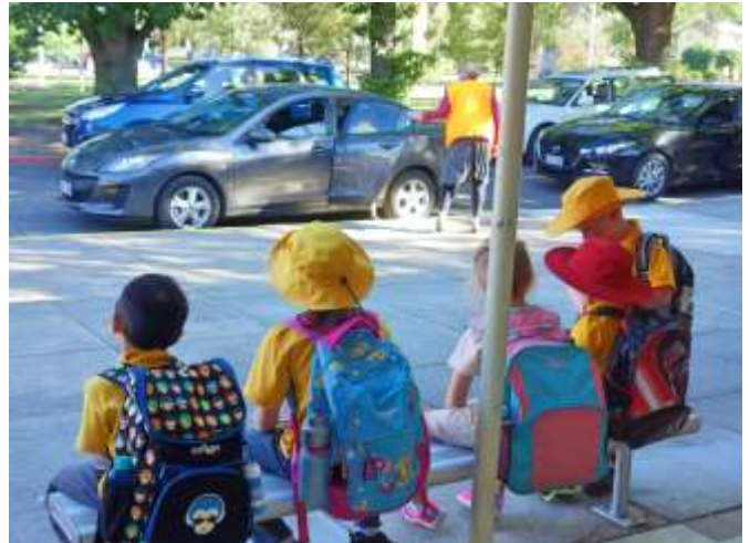
A safe place to wait while Parent volunteer Ali Bos escorts students to their cars.

If the kids aren't there when the family car pulls up, the car is waved on to complete a circuit of nearby streets and return to the end of the queue