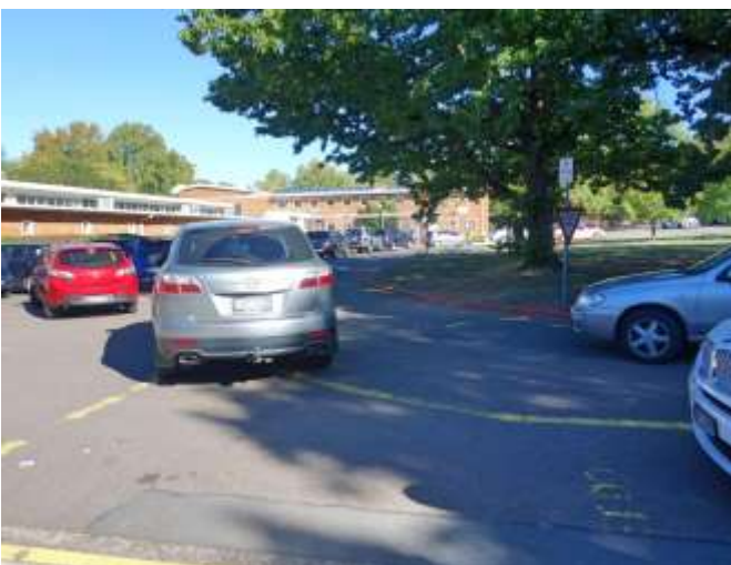
A clear zone and give way sign means cars can leave smoothly from the junior pick-up area, through the queue for the senior pick-up zone.

It wasn't always this orderly, apparently. Some