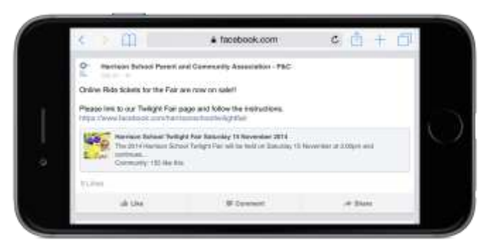
Facebook is an integral part of Harrison School's P&C. Check out www.facebook.com/HarrisonSchoolPandC

We find the internal groups fast, easy and convenient. As P&C president, I can check how things are going on a particular activity when needed, rather than being bombarded with