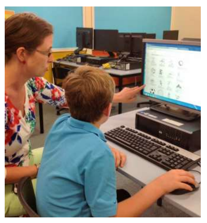
Teacher librarians explicitly teach information literacy — a crucial skill for today's students.

Teachers are NOT teacher librarians. A qualified TL has dual tertiary qualifications in both teaching and information studies. Studies show that the information literacy skills of many teachers and principals are not very strong. Nor are the information literacy skills of many so-called 'digital natives' (people who have grown up with the internet). Finding out what time a movie is showing is NOT information literacy – relevant skills need to be explicitly taught and practised.