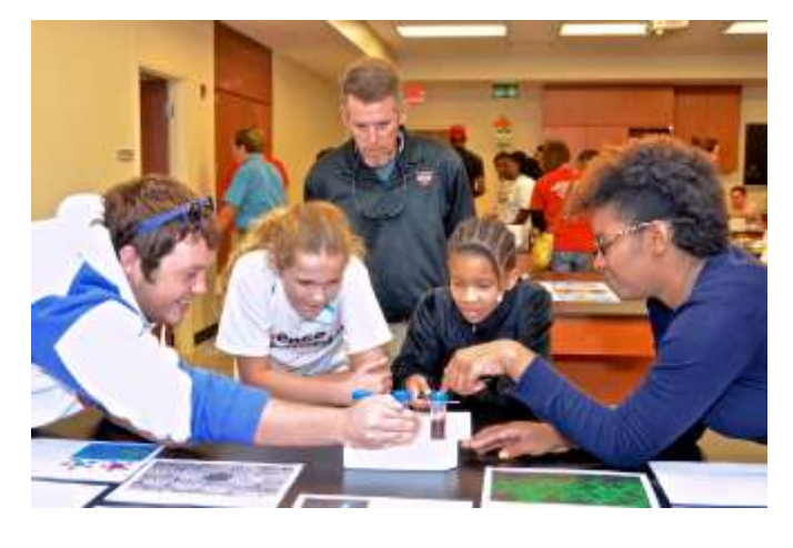
Events such as school science nights are one way to get parents more engaged in their child's learning.