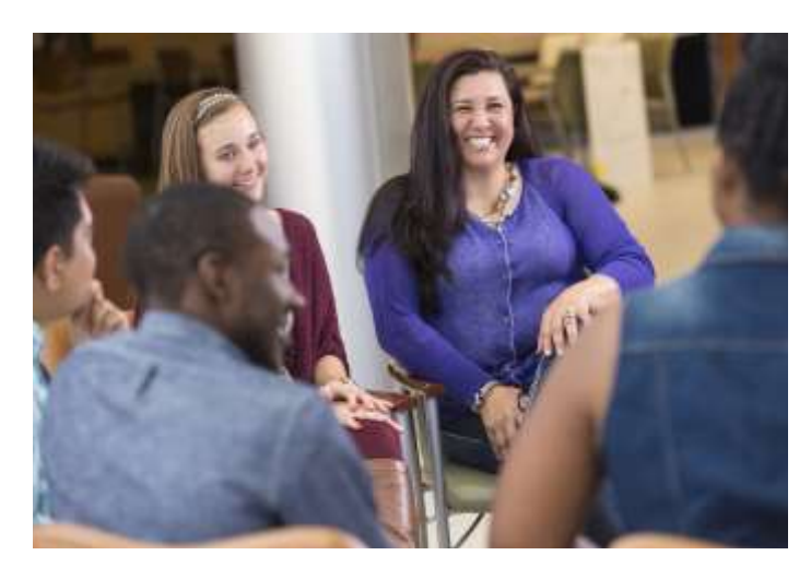
Make your AGM friendly and a chance for parents to meet other parents.