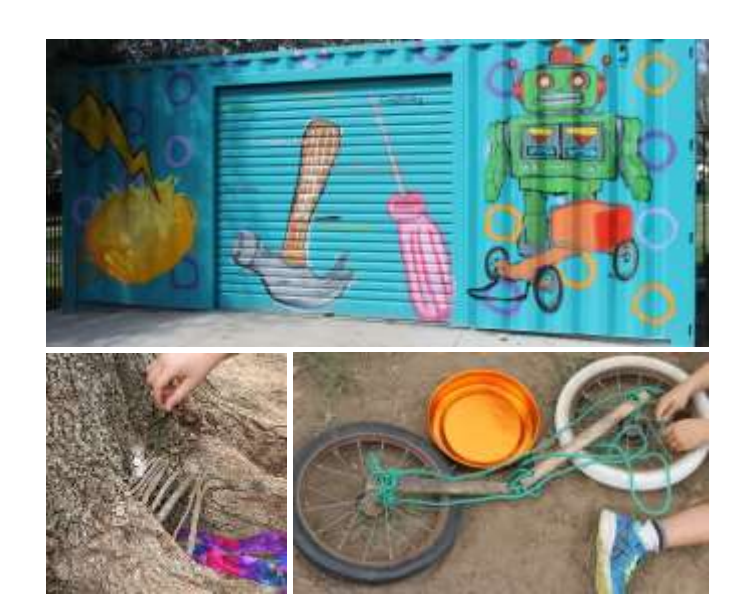
The Lyons Loose Parts shed and several creations.

At our Early Childhood School, we set up a Loose Parts shed using a 'retired' shipping container and spruced it up thanks to the fantastic talent