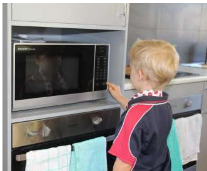
Fadden Primary's P&C recently paid for a new teaching kitchen, which the kids and teachers are loving.