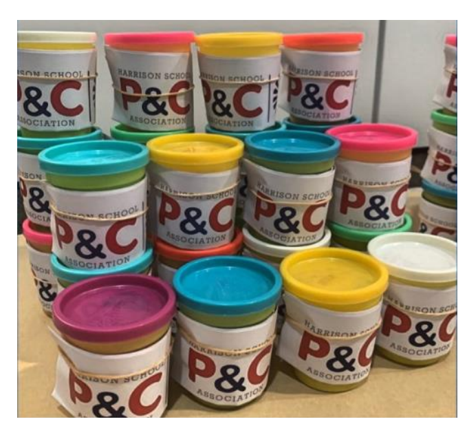
A tub of playdough to welcome each new family, wrapped in a note introducing the Harrison P&C.