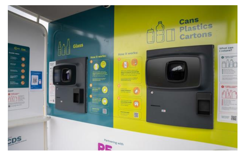
The first reverse vending machine (RVM) in Tuggeranong

The RVM is open from 7am to 7pm, seven days a week and is powered by solar energy to further reduce any impact on the environment.