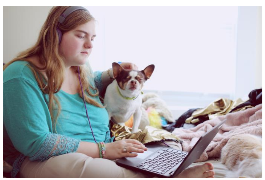
Telehealth appointments with School Psychologists were first established during COVID lockdown and continue to be available.

Students presenting with the greatest risk factors (risk to self or others) are prioritised. All school