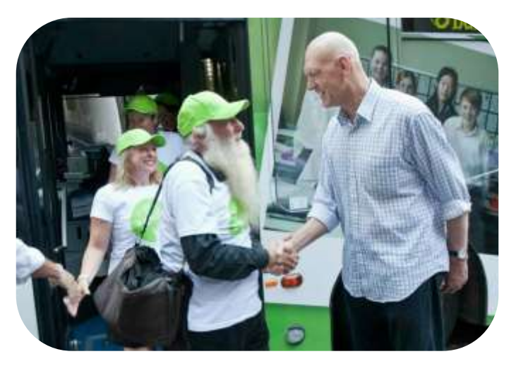
Peter Garrett meets with parents and teachers to discuss the implementation of the Gonski Review.